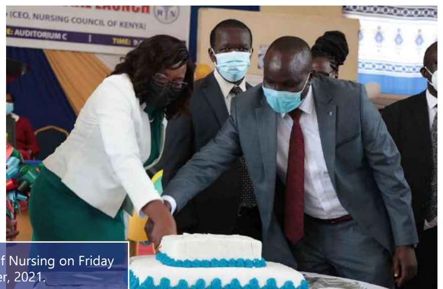
Launch of the School of Nursing on Friday 15 th October, 2021.