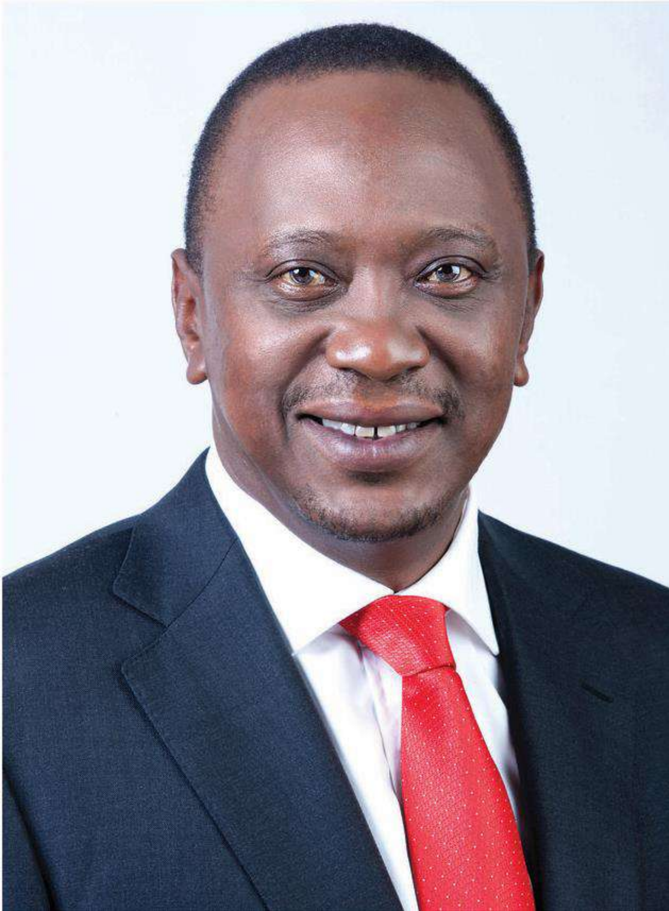
His Excellency, Hon. Uhuru Kenyatta, C.G.H., President of the Republic of Kenya and Commander-in-Chief of the Defence Forces and Chancellor of Kibabii University