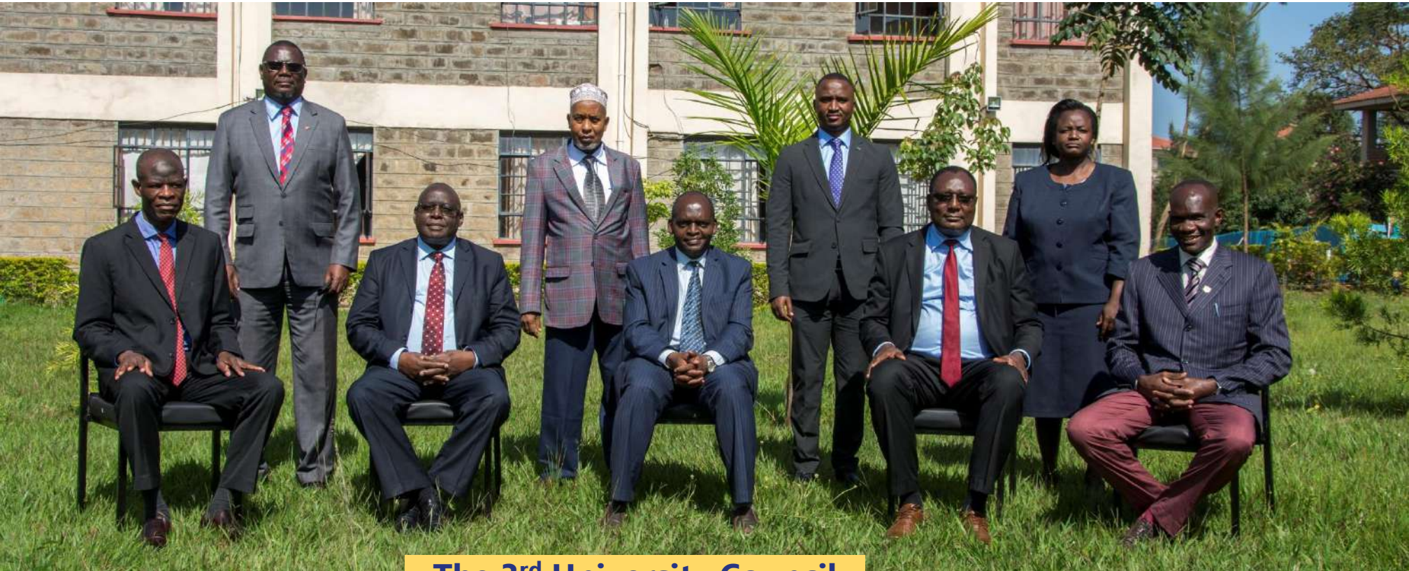
The 3 rd University Council