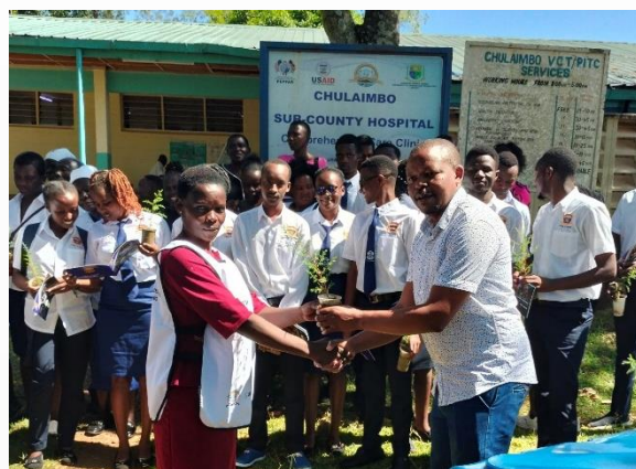
14 th March 2025: SON at Chulaimbo Sub County Hospital distributing Seedlings to the Community Health Promoters for distribution.

The School also champions environmental sustainability, aligning with Kenya's climate action agenda. Faculty and students have participated in nationwide tree-planting exercises and other environmental health initiatives, reinforcing the vital connection between environmental stewardship and human health.