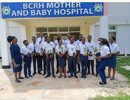
11 th April 2025: Bungoma County Referral Hospital: Mother and Baby Hospital. School of Nursing Faculty and Students Ready to Plant Seedlings