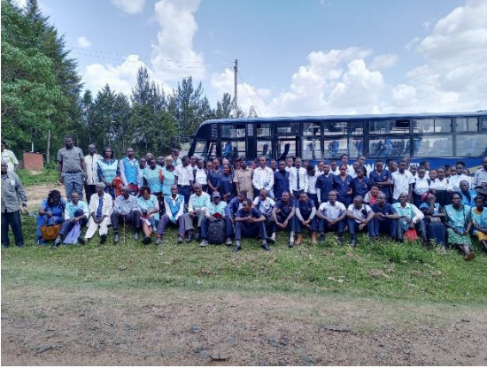
SON staff and students undertaking Community based education, research, and extension services.