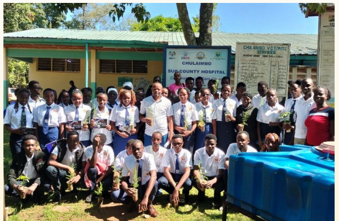
14 th March 2025: Chulaimbo Sub County Hospital. With School of Nursing Faculty and Students Ready to Plant Seedlings