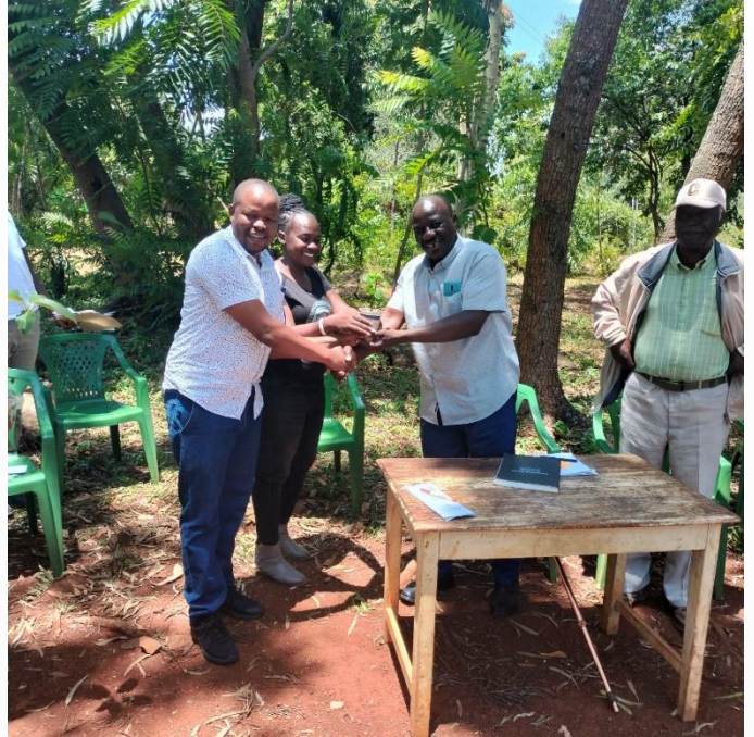
14 th March 2025: Chief's Camp in Nyahera Sublocation. Distributing of Seedlings to the Local Leadership for Distribution Courtesy Kibabii University.