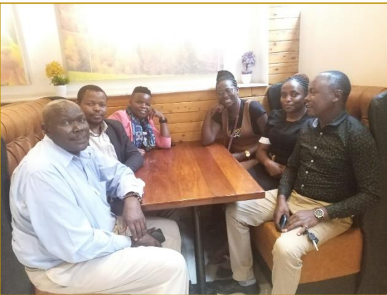
School of Nursing Staff Team Building