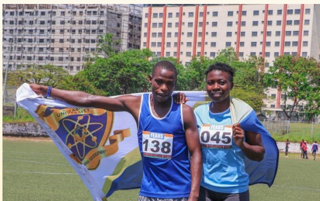
Our Athletes at the East African University Games in Kisumu, 2024.

To the graduates, you have reached this milestone through hard work, resilience, and determination. Today marks not just the completion of your studies, but the beginning of a new chapter filled with opportunity. Step into the future with confidence, armed with the knowledge, values, and experiences gained at Kibabii University. Embrace challenges as chances to grow, trust your instincts, and never lose sight of your purpose. The journey ahead is rich with possibilities, and you have everything it takes to make a lasting, positive impact on the world.